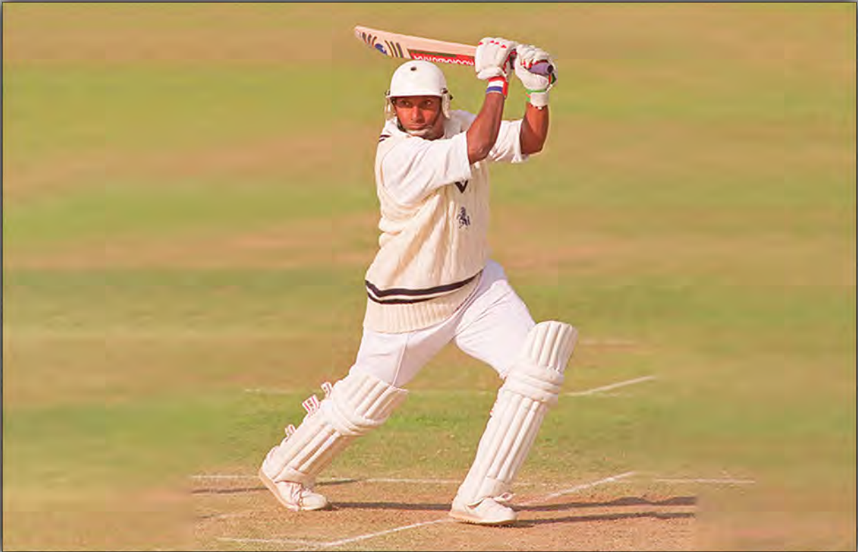
Aravinda de Silva during his whirlwind 225 for Kent against Nottinghamshire at Trent Bridge during the 1995 County Cricket Season.